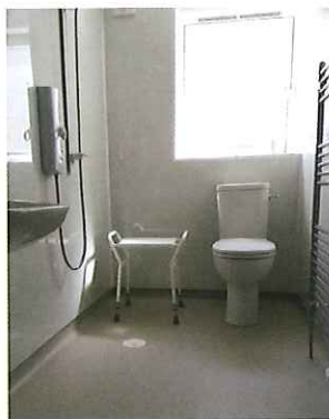
Wet floor shower

We work closely with East Lothian Council to identify the best solution and will guide you through the process offering assistance as you require it. Practical help with drawings, building work, contractors, permissions, grants and charitable funding.